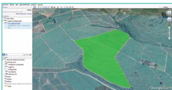
Google Earth Display of the full fertilization plan

In-depth multi-variable mapping and operating records including working time, stationary, transfer, speed, applied dose and other valuable data for further analysis.